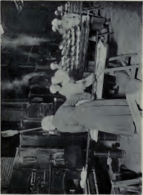
W.A.A.C.s in the Bakery.